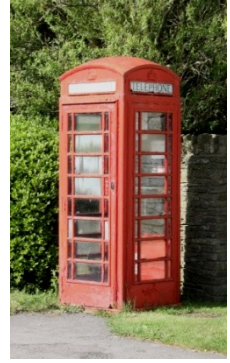
Picture 4.6.2 - Communication service providers, other are available.

83% of households have an internet connection. Of the 15 households (13%) that do not have an internet connection, 4 are at 4 Acres. 11 are in Somerford Keynes, of which 9 contain members who are over 60 years in age.